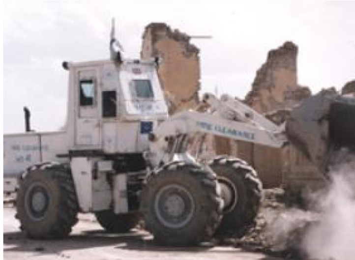
Figure 2: Armoured Front-end Loader removing rubble ( Reference: IMAS TN 09.50/01 )