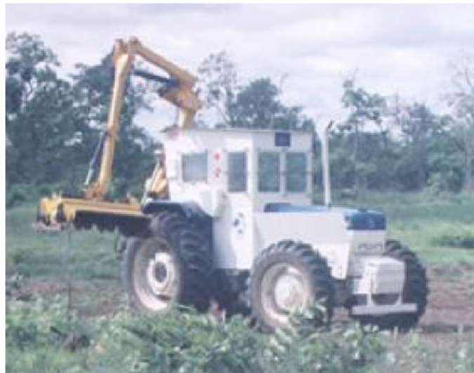
Figure 3: Armoured Tractor fitted with Vegetation Cutter ( Reference: IMAS TN 09.50/01 )