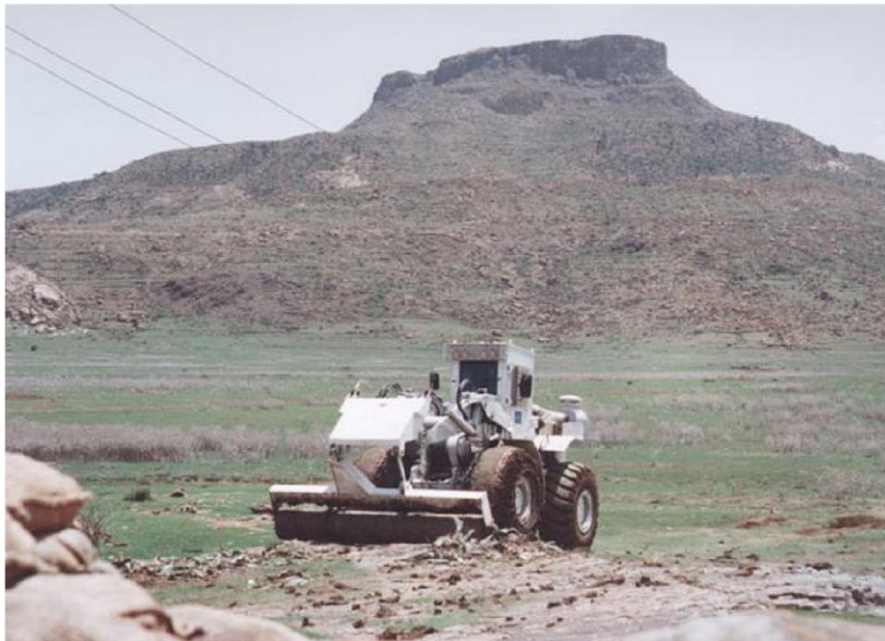
Figure 1: Armoured Front-end Loader with AP Mine Rollers ( Reference: IMAS TN 09.50/01 )